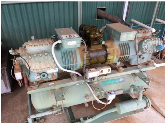
Figure 1: Oil fouling visible on the outside of a compressor

Oil is used as a lubricant in refrigeration compressors for cool rooms and vacuum coolers. During the operation of a compressor, oil can build up inside the refrigerant piping and reduce the efficiency of the temperature transfer in the system, in a process called oil fouling.